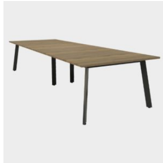
Ant Multi-Leg MEETING/DINING TABLE OWNWORLD