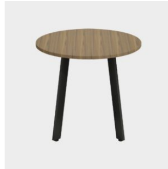
Ant COUNTER/BAR HEIGHT TABLE OWNWORLD