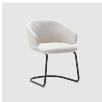
Binar 60 Cantilever