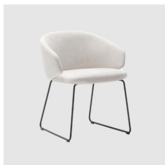
Binar 60 Sled