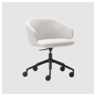
Binar 60 5-Way on Castors