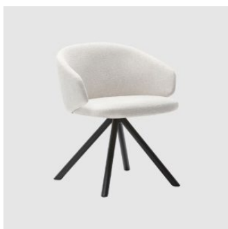
Binar 60 Metal Trestle