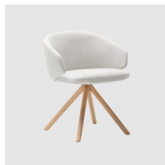
Binar 60 Timber Trestle