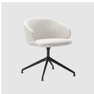
Binar 60 Metal 4-Way Swivel