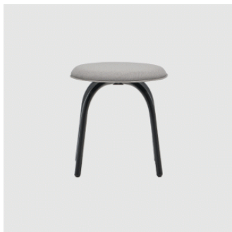
Bowler Backless Low