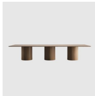
Bruce Timber Multibase MEETING/DINING TABLE OWNWORLD