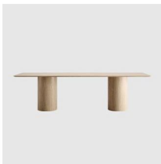
Bruce Timber COUNTER/BAR HEIGHT OWNWORLD