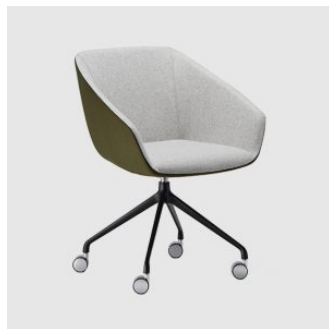
Delphi 4-Way Swivel on Castors MEETING ARMCHAIR ADVANTA