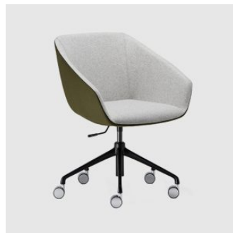
Delphi 5-Way on Castors TASK ARMCHAIR ADVANTA