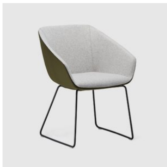
Delphi Sled ARMCHAIR ADVANTA