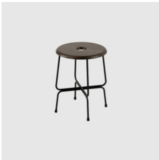
Greene Low STOOL DOWEL JONES