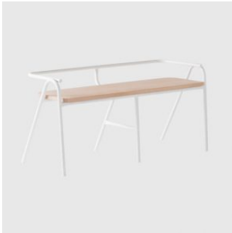
Half Hurdle BENCH DOWEL JONES