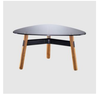
Okidoki SIDE/COFFEE TABLE THINKING WORKS