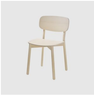
Okidoki CHAIR THINKING WORKS