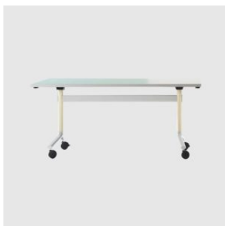
Okidoki FOLDING TABLE THINKING WORKS