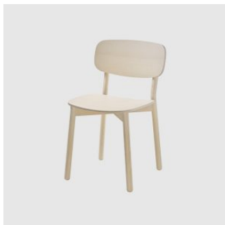
Okidoki CHAIR THINKING WORKS