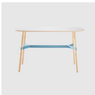
Okidoki COUNTER/BAR HEIGHT TABLE THINKING WORKS