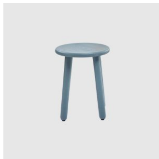
Okidoki Too Low STOOL THINKING WORKS