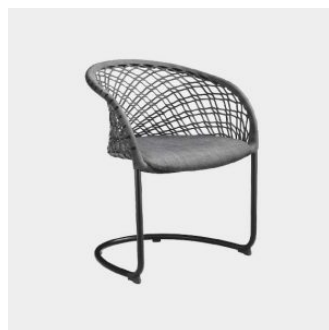
P47 Cantilever ARMCHAIR MIDJ