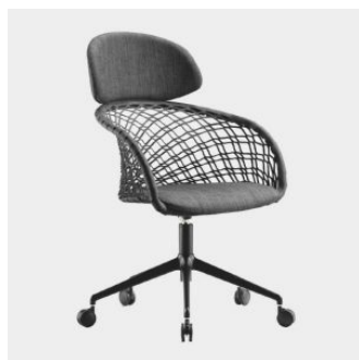
P47 5-Way Castor TASK ARMCHAIR MIDJ