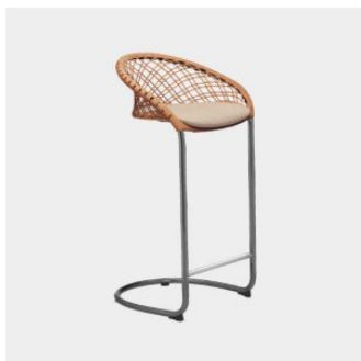
P47 Cantilever STOOL MIDJ