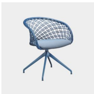
P47 4-Way Swivel MEETING ARMCHAIR MIDJ