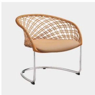
P47 Cantilever LOUNGE CHAIR MIDJ