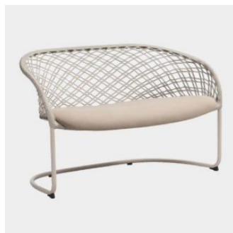
P47 Cantilever LOUNGE MIDJ