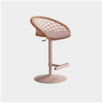
P47 Pedestal STOOL MIDJ