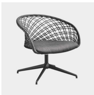
P47 4-Way Swivel LOUNGE CHAIR MIDJ