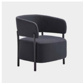
RC Metal LOUNGE CHAIR BLASCO&VILA