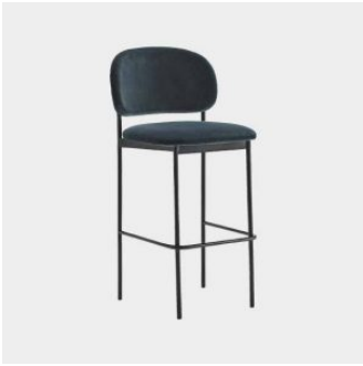
RC Metal STOOL BLASCO&VILA