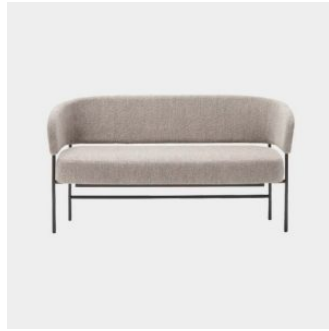
RC Metal Easy LOUNGE BLASCO&VILA