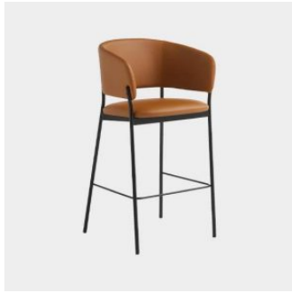
RC Metal with Arms STOOL BLASCO&VILA