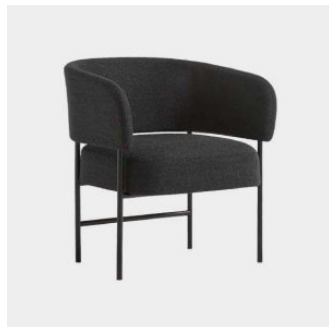
RC Metal Easy LOUNGE CHAIR BLASCO&VILA