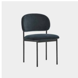
RC Metal CHAIR BLASCO&VILA