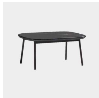
RC Metal SIDE/COFFEE TABLE BLASCO&VILA