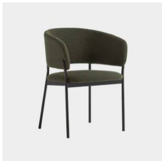
RC Metal ARMCHAIR BLASCO&VILA