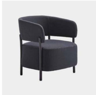
RC Metal LOUNGE CHAIR BLASCO&VILA