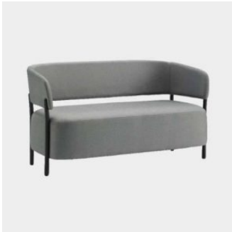
RC Metal LOUNGE BLASCO&VILA