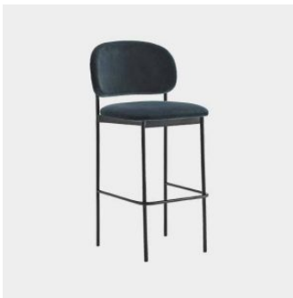
RC Metal STOOL BLASCO&VILA