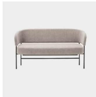
RC Metal Easy LOUNGE BLASCO&VILA