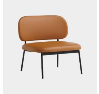
RC Metal Lobby LOUNGE CHAIR BLASCO&VILA