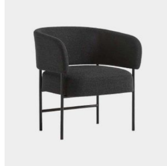
RC Metal Easy LOUNGE CHAIR BLASCO&VILA