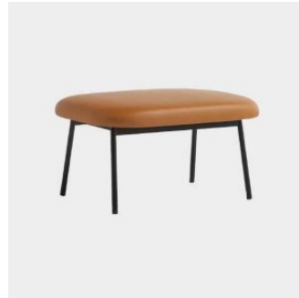
RC Metal OTTOMAN BLASCO&VILA