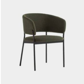
RC Metal ARMCHAIR BLASCO&VILA