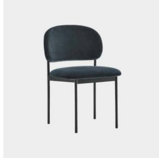
RC Metal CHAIR BLASCO&VILA