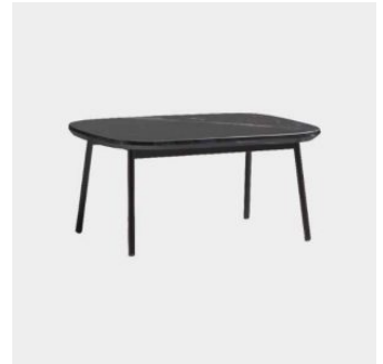
RC Metal SIDE/COFFEE TABLE BLASCO&VILA