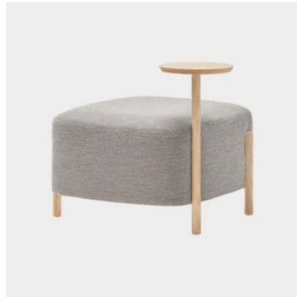
RC Wood OTTOMAN BLASCO&VILA