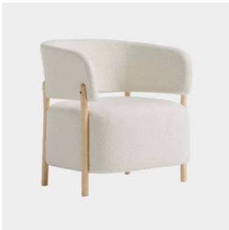
RC Wood LOUNGE CHAIR BLASCO&VILA