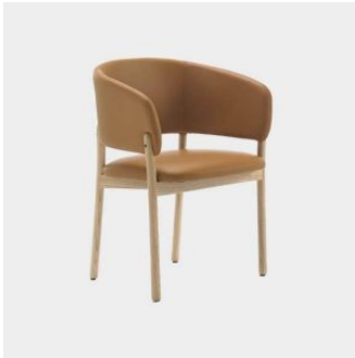
RC Wood ARMCHAIR BLASCO&VILA