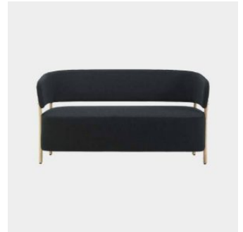
RC Wood LOUNGE BLASCO&VILA