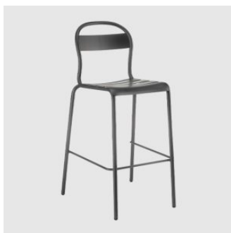
Stecca STOOL COLOS