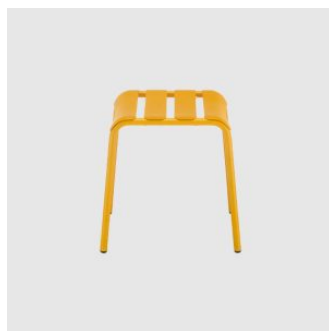
Stecca Low STOOL COLOS