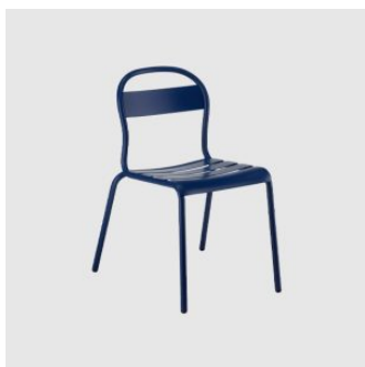
Stecca STACKING CHAIR COLOS