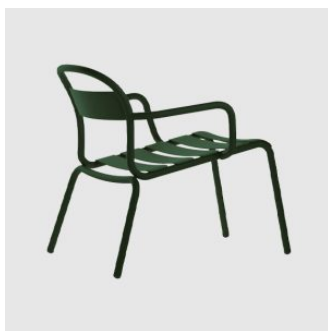
Stecca LOUNGE CHAIR COLOS