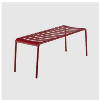
Stecca BENCH COLOS