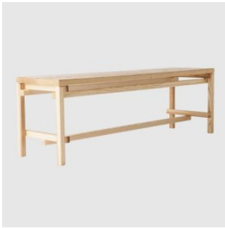
Tim Ber Bench BENCH DOWEL JONES