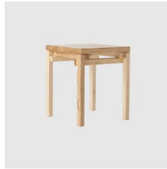
Tim Ber Low STOOL DOWEL JONES