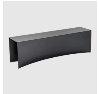
Void BENCH DESALTO