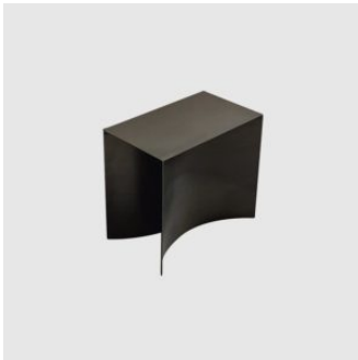
Void STOOL DESALTO