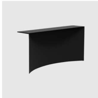
Void CONSOLE TABLE DESALTO