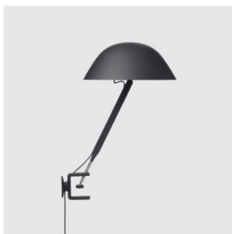
w103 Sempe CLAMP LAMP WÄSTBERG