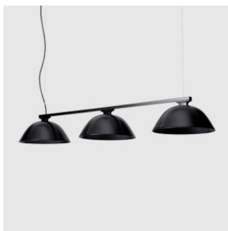
w103 Sempe MULTI PENDANT LIGHT WÄSTBERG