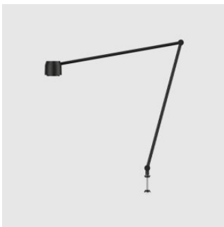
w225 lon FIXED LAMP WästBERG