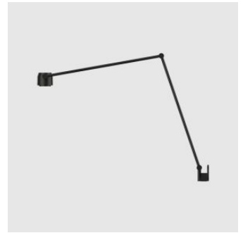
w225 lon WALL LAMP WästBERG