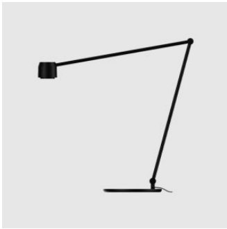
w225 lon TASK LAMP WästBERG