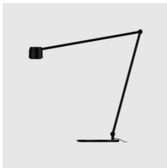
w225 lon TASK LAMP WÄSTBERG