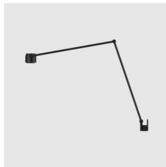
w225 lon WALL LAMP WÄSTBERG