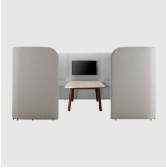
Work With Me WORK POD ADVANTA