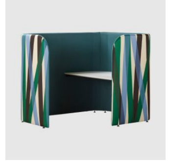
Work With Me WORK POD SWISS DESIGN