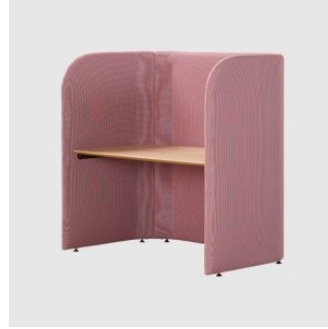
Work With Me (C) WORK POD ADVANTA